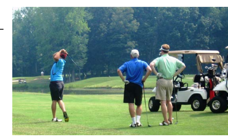
Thanks to all of the brothers, sponsors, and players who made our third annual Winston-Salem Scottish Rite Masonic Golf Tournament such an overwhelming success. The ASU and ECU learning Disorders Clinics will benefit from the hard work and assistance.

In a tense world full of conflicts, frustrations, and competition, civility is an important social lubricant that helps us live together constructively. We need to display our Masonic fundamentals of tolerance, civility, kindness and Brotherly Love to all... as we are encouraged to do in our Closing Charge.